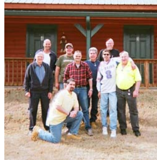
Participants of Prayer Retreat

Saturday morning started with fasting and a prayer time began in the